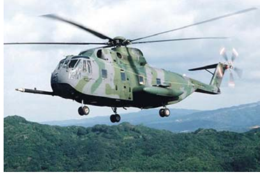
HH-3 Jolly Green