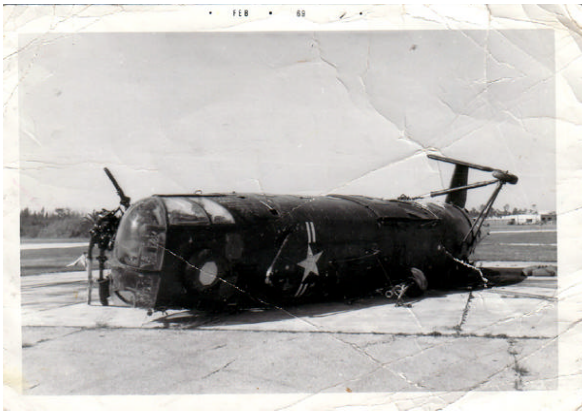
IF YOU HAVE ANY INFORMATION PLEASE LET US KNOW/PHOTO DATED FEB 1969 COURTESY OF ART BRAND/

Did you know that 39 Air Force helicopter pilots became General Officers?