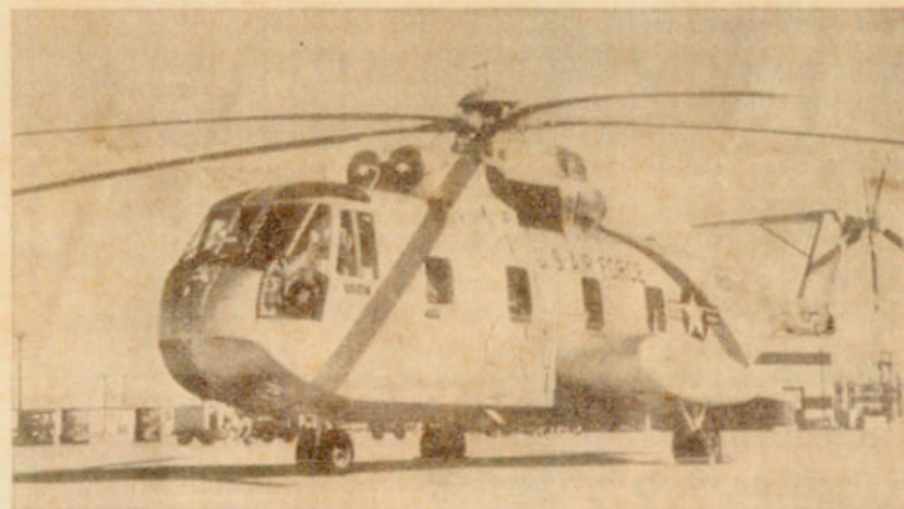
NEW USAF HELICOPTER . . . CH-3C will undergo extensive tests here.

The helicopter is capable of carrying 23 troops, has a rear